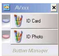
The Button Panel

1. After the Button Manager and the scanner driver have been successfully installed on your computer, the Button Panel will be displayed in the Windows System Tray at the bottom right corner of your computer screen.